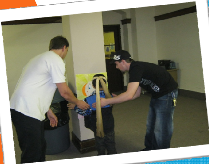
Playing Pin the Nose on the Clown on Circus Day

The above financial information was obtained from our most recent audited financial statements. PathStone received an unqualified audit report; there were no findings, or questioned costs, and no Management Letter. A complete set of our audited financial statements are available to the public at our office located at 400 East Ave, Rochester, NY 14607