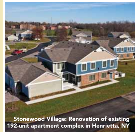
Stonewood Village: Renovation of existing 192-unit apartment complex in Henrietta, NY