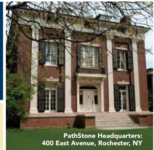
PathStone Headquarters: 400 East Avenue, Rochester, NY

Estamos orgullosos de ser un socio de PathStone.